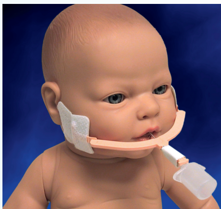
ET tube holder

NeoBar offers the ideal balance between security and comfort for securing endotracheal tubes for babies. The eight color-coded sizes ensure optimised fit and gentle tabs help to reduce need for potentially harmful tape on delicate skin. Neobar is carefully designed to protect the baby's palate, enable good oral care, and reduce the chance of accidental extubation.